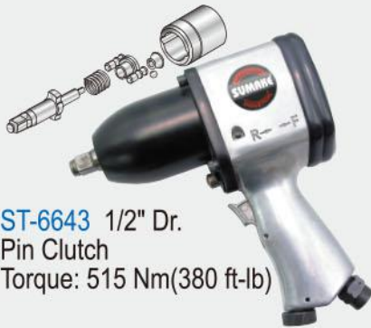
ST-6643 1/2" Dr. Pin Clutch Torque: 515 Nm(380 ft-lb)