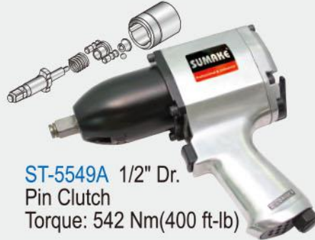
ST-5549A 1/2" Dr. Pin Clutch Torque: 542 Nm(400 ft-lb)