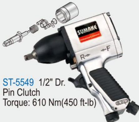
ST-5549 1/2" Dr. Pin Clutch Torque: 610 Nm(450 ft-lb)