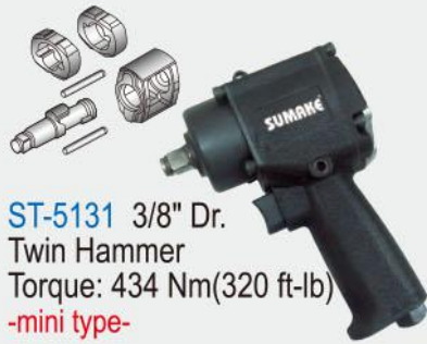
ST-5131 3/8" Dr. Twin Hammer Torque: 434 Nm(320 ft-lb) -mini type-