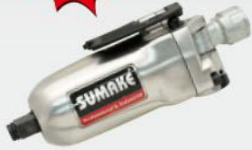
ST-55303 3/8" Dr. Twin Dog Torque: 108 Nm(80 ft-lb)