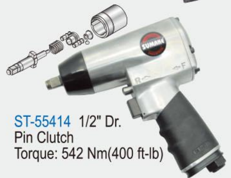
ST-55414 1/2" Dr. Pin Clutch Torque: 542 Nm(400 ft-lb)