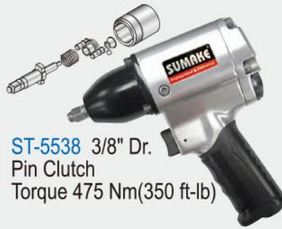
ST-5538 3/8" Dr. Pin Clutch Torque 475 Nm(350 ft-lb)