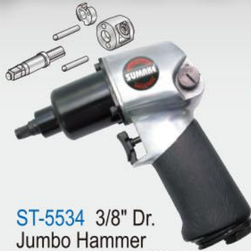
ST-5534 3/8" Dr. Jumbo Hammer Torque: 271 Nm(200 ft-lb)