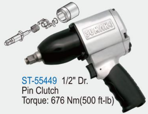
ST-55449 1/2" Dr. Pin Clutch Torque: 676 Nm(500 ft-lb)