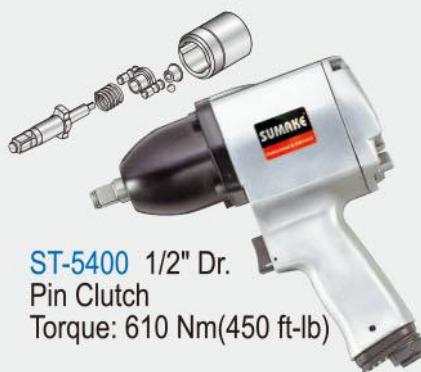
ST-5400 1/2" Dr. Pin Clutch Torque: 610 Nm(450 ft-lb)