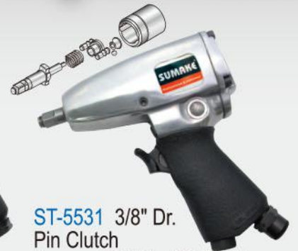
ST-5531 3/8" Dr. Pin Clutch Torque: 298 Nm(220 ft-lb)