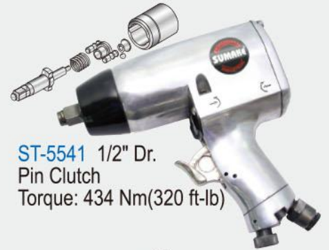
ST-5541 1/2" Dr. Pin Clutch Torque: 434 Nm(320 ft-lb)